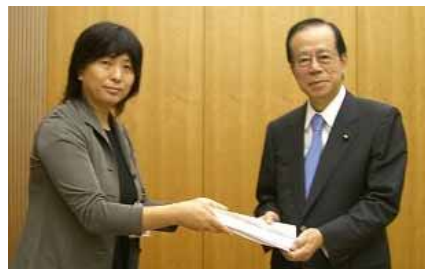
September 2008 Prime Minister Yasuo Fukuda and Yuri Tazawa at the prime minister's official residence. The proposal of "Improving Societal Conditions for Working Women" was submitted.